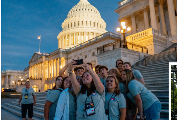
ABOVE In 2022, Arkansas Youth Tour delegates took a private evening tour of the U.S. Capitol.

RIGHT The 2022 Electric Cooperatives of Arkansas Youth Tour delegation in front of the White House.